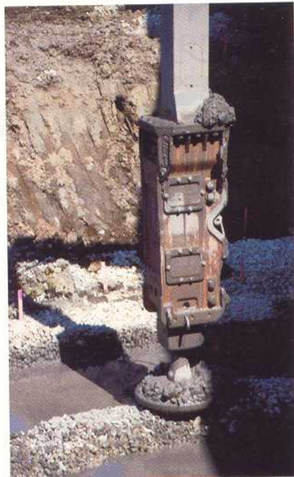
After the aggregate is dumped into the hole, PCI uses an NPK tamping attachment to ram the aggregate, stabilizing and strengthening the pier-soil system.

The performance expected from the Geopier elements, according to Steve Megivern, P.E., of The Pro Firm, is